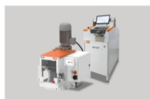
High Voltage Wire Processing Equipment(17)