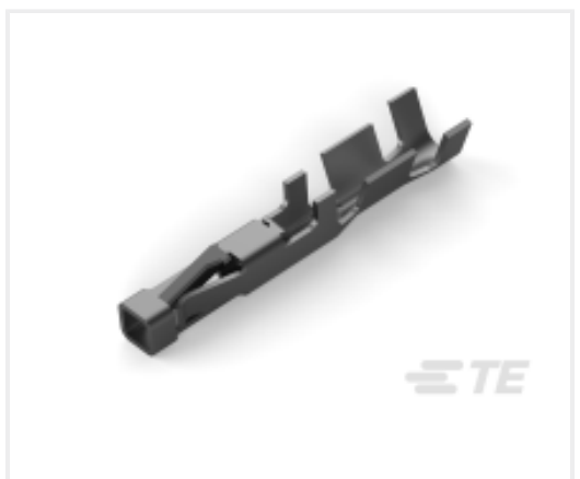
TE Part # 794606-1 MICRO MNL RPT CNT STRIP 20-24