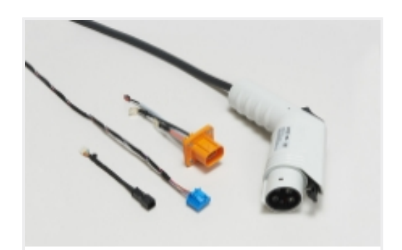
Electric, Hybrid & Fuel Cell Cable Assemblies(101)