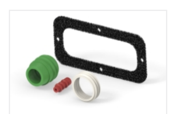
Connector Seals & Cavity Plugs(5)