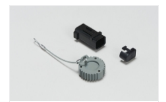
Automotive Connector Caps & Covers (56)