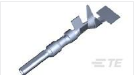
TE Part #1-794223-0 MINI UMN2 SCKT 20-16AWG 30AU