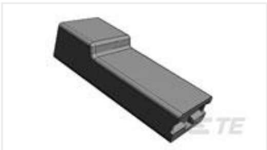
TE Part #154509-2 250 FASTON HSG., REC., 1 POS, NATRUAL