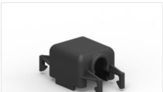
TE Part #1897096-2 WIRE COVER FOR MQS SLD 6P CONN'R