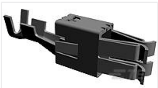
TE Part #962938-1 MPT REC 9.5 Contact SWS Sn