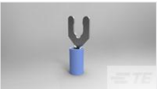
TE Part #52937 TERMINAL, PIDG SPR SPD 16-14 10