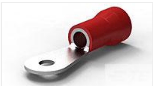
TE Part #52041-7 TERMINAL R PG 8 1/4