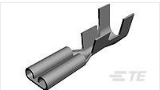
TE Part #42068 110 FASTON REC 22-18 AWG BR