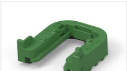
TE Part #1670720-8 SLIDE, TAB HSG GROUP C