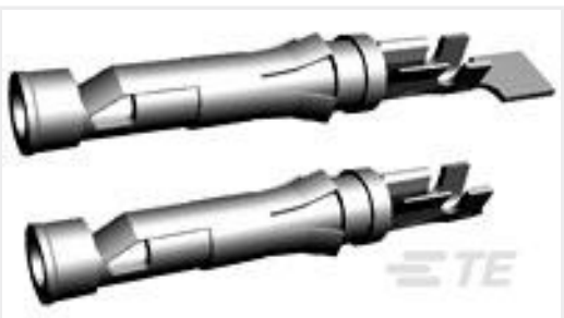
TE Part #1-66358-0 III+ SKT, 18-14, 30AU/FL, STRIP