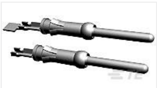
TE Part #1-66359-0 III+ PIN, 18-14, 30AU/FL, STRIP