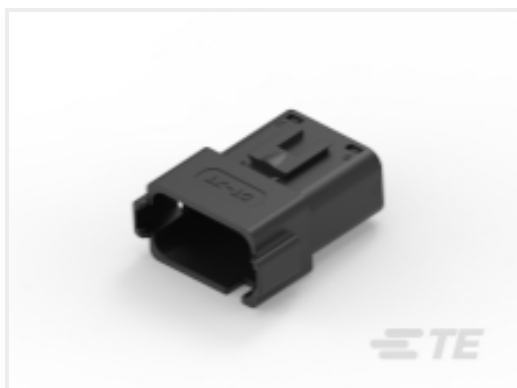
TE Part # 2600046-1 18CCT RECEP BLACK KEYING A W /SEAL