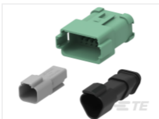
TE Part #CAT-J41-DDRC DEUTSCH DT Receptacle Connectors