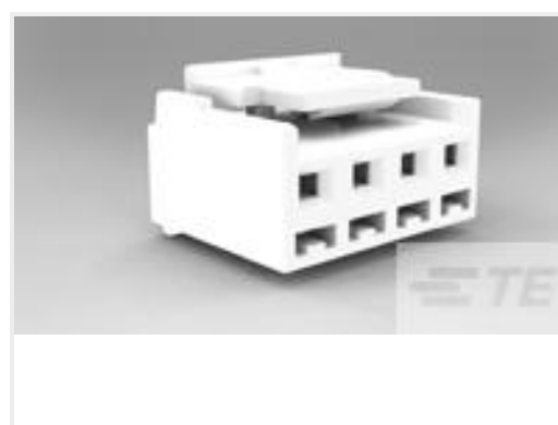
TE Part #2132781-8 08P EP-II HOUSING, NATURAL