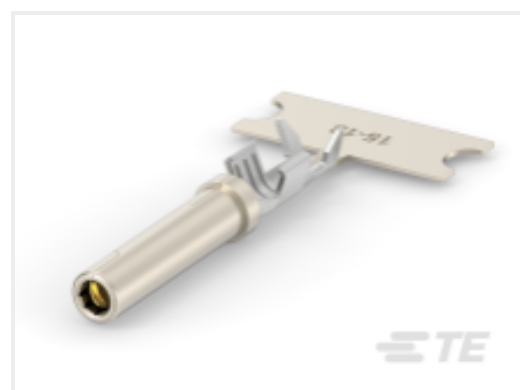
TE Part #5-2600021-5 XRC SOCKET 20-24 AWG Gold Plated