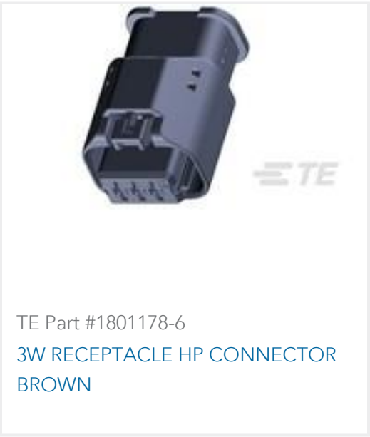
TE Part #1801178-6 3W RECEPTACLE HP CONNECTOR BROWN