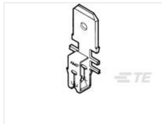
TE Part #2232555-1 MAG-MATE W/250 CONN TAB TPBR