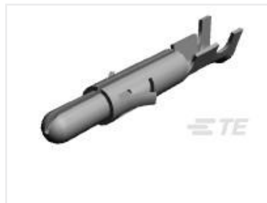
TE Part #350561-1 UMNL PIN 24-18 .0126 PTPBR