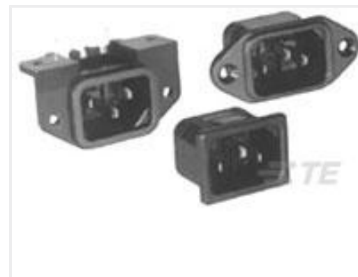
TE Part #1609133-3 6ESRM-3=F6920