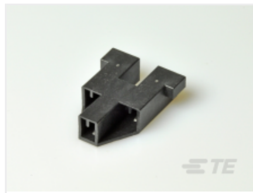
TE Part # 2825082-2 CLUSTER BLOCK HSG_V0-GWT