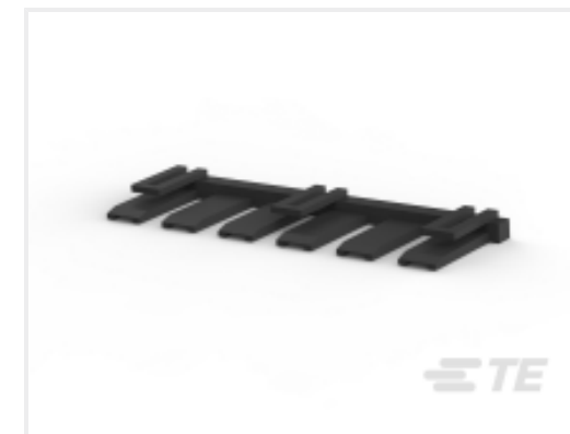
TE Part #2232900-6 ECONOMY POWER TPA RETAINER