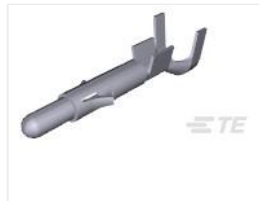
TE Part #350538-1 UMNL PIN 20-14 .0126 PTPBR