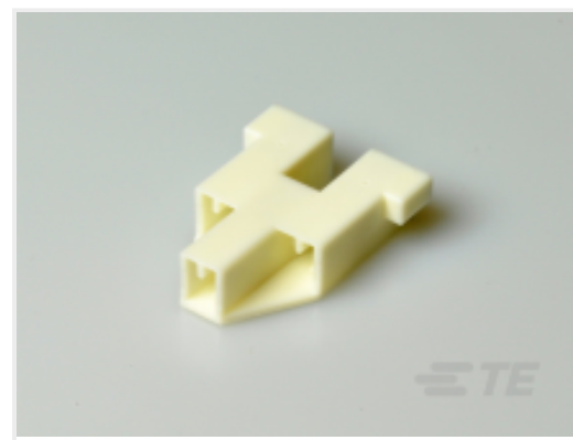
TE Part # 2825082-1 CLUSTER BLOCK HSG PBT