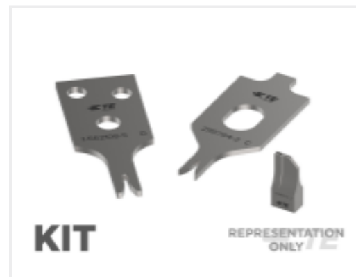
TE Part # 7-2150527-7 OCEAN_2.0_SPARE_PART_KIT- 090F150F