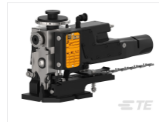
TE Part # 2150527-2 OCEAN_2.0_Applicator-E-090F150F- REA