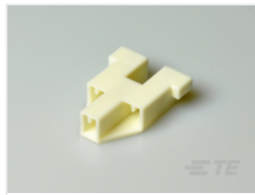
TE Part #2825082-1 CLUSTER BLOCK HSG PBT