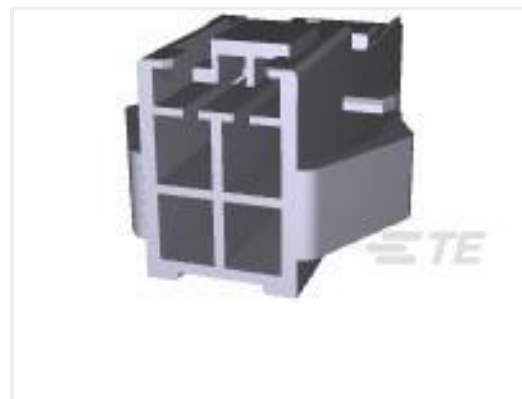
TE Part #176294-1 UNIV POWER CAP HSG 4P P/MOUNT