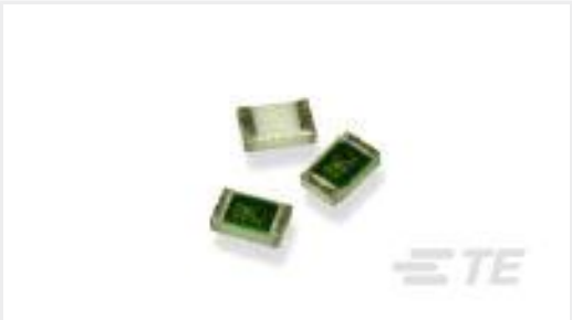
TE Part #8-1879223-6 CPF 0603 2K15 0.1% 25PPM 1K RL