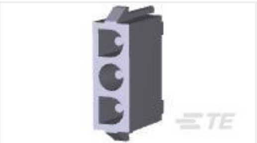
TE Part #1-641966-1 03P UMNL PIN HDR ASSY BLK