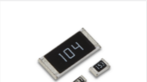
TE Part #2-2176345-7 CRGCQ 1210 1K5 1%