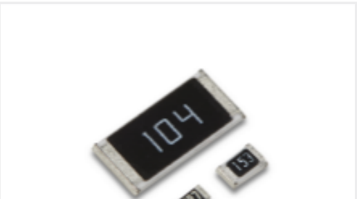
TE Part #3-2176345-8 CRGCQ 1210 12K 1%