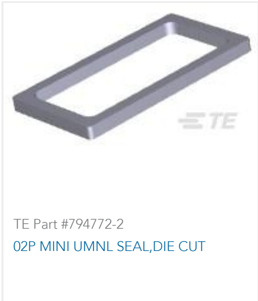
TE Part #794772-2 02P MINI UMNL SEAL,DIE CUT