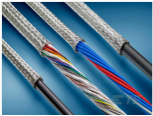
TE Part #CQ50453001 RAY-101-6.0(10)