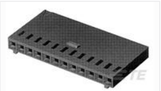
TE Part #102241-3 05 MODIV HSG COMP SR .100 POL