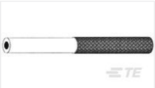
TE Part #D761993001 RAY-101-10.0(100)