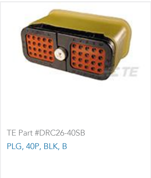
TE Part #DRC26-40SB PLG, 40P, BLK, B