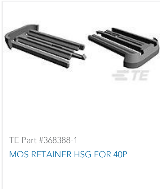
TE Part #368388-1 MQS RETAINER HSG FOR 40P