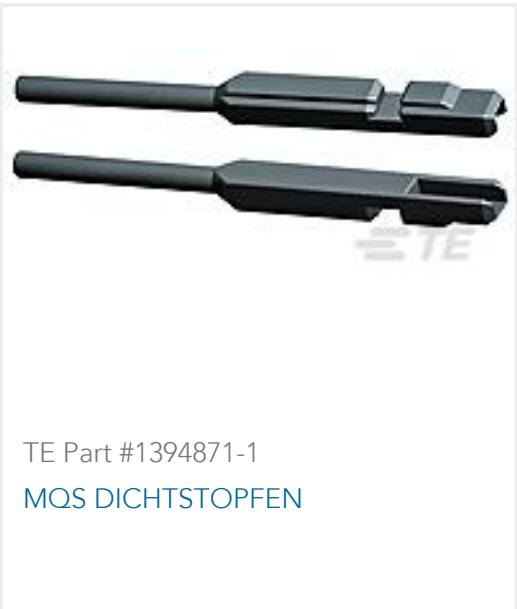
TE Part #1394871-1 MQS DICHTSTOPFEN