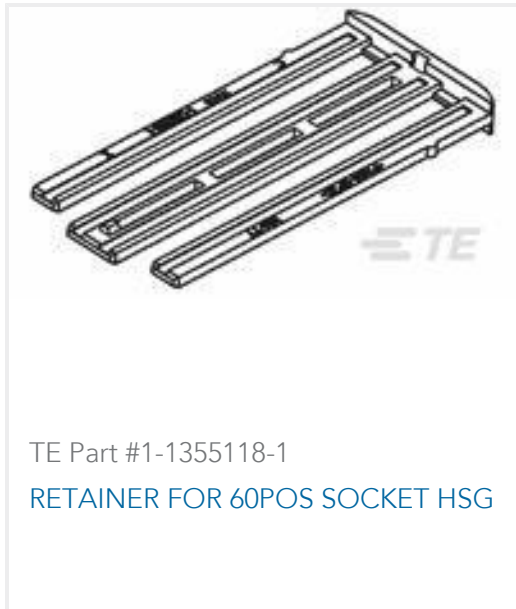
TE Part #1-1355118-1 RETAINER FOR 60POS SOCKET HSG