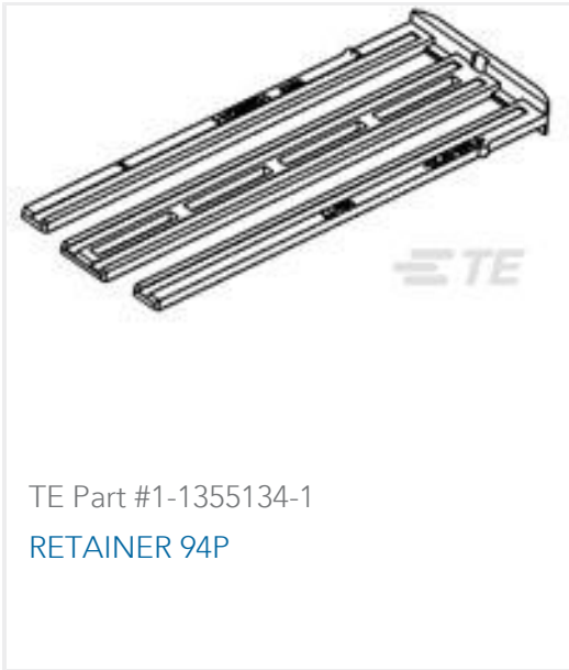
TE Part #1-1355134-1 RETAINER 94P