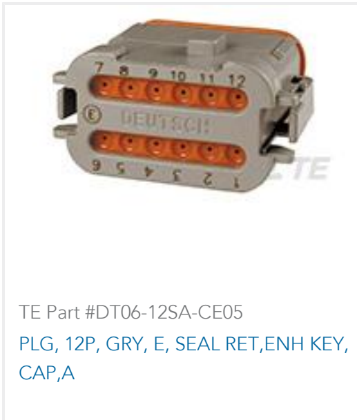
TE Part #DT06-12SA-CE05 PLG, 12P, GRY, E, SEAL RET, ENH KEY, CAP, A