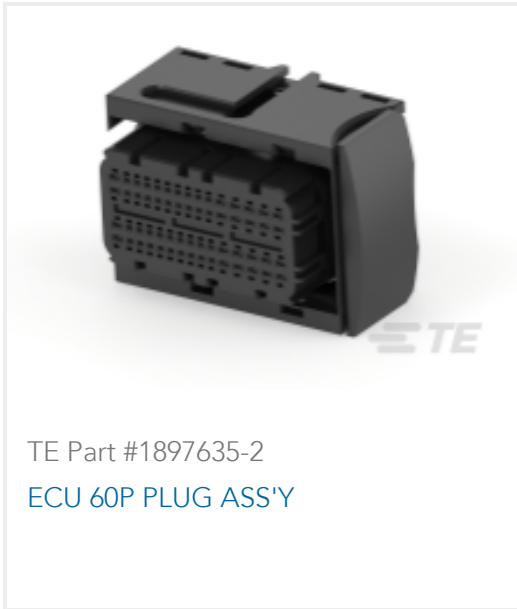
TE Part #1897635-2 ECU 60P PLUG ASS'Y