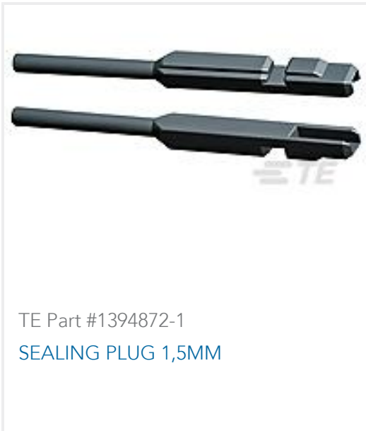
TE Part #1394872-1 SEALING PLUG 1,5MM