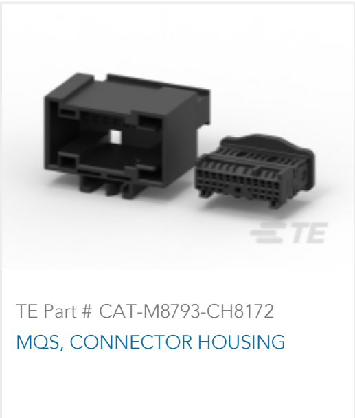
TE Part # CAT-M8793-CH8172 MQS, CONNECTOR HOUSING