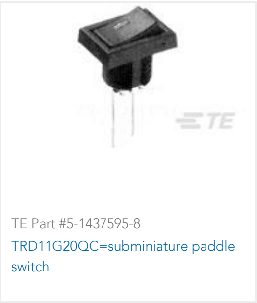
TE Part #5-1437595-8 TRD11G20QC=subminiature paddle switch