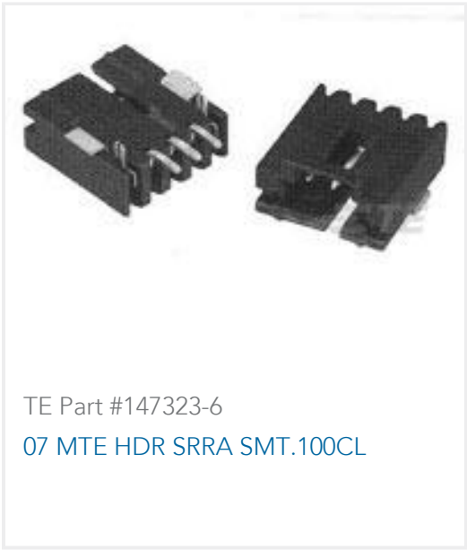
TE Part #147323-6 07 MTE HDR SRRA SMT.100CL