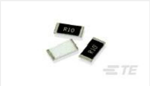
TE Part #4-2176057-5 RLP73K 3A R68 1% 1K RL