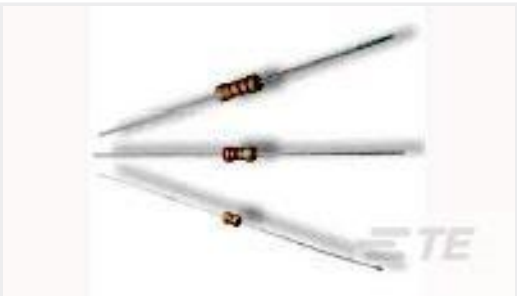
TE Part #1623925-2 CFR100 5% 100R