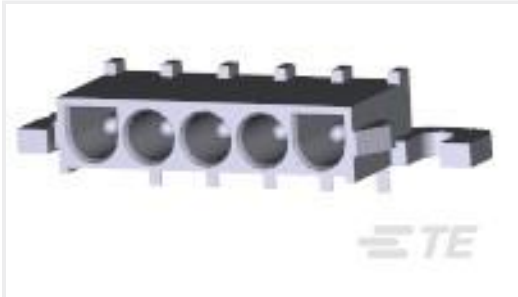
TE Part #1-350945-0 05P UMNL HDR ASSY R/A 94VO