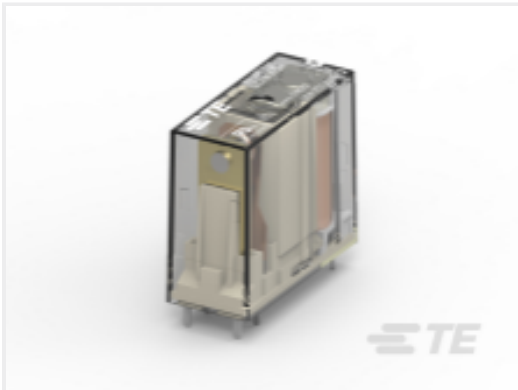
TE Part #1393230-7 RP3SL005