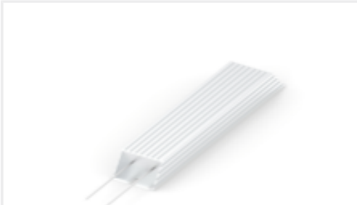
TE Part #2176505-7 CJP 120W 22R 5% Lead