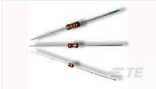
TE Part #3-1623933-1 CFR50 5% 47K