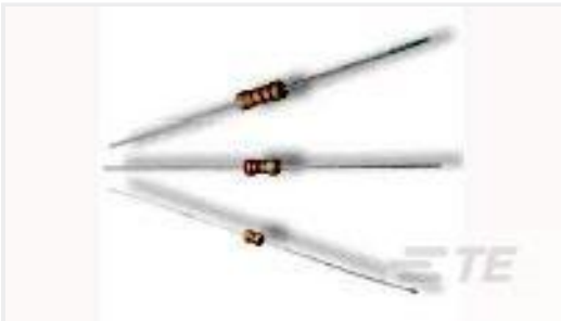
TE Part #1623930-5 CFR25 5% 10R