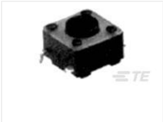
TE Part #4-1437565-2 FSM4JSMATR=TACT SWITCH 6X6MIL