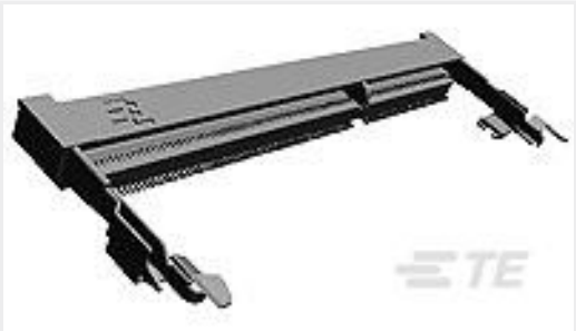
TE Part #2-2013310-2 EMBOSS TAPE DDR3 204P 9.2H STD