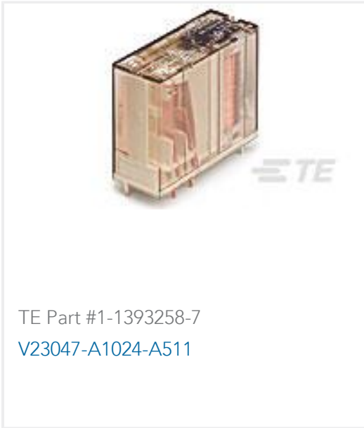
TE Part #1-1393258-7 V23047-A1024-A511