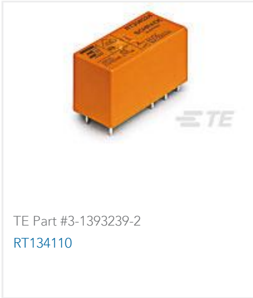
TE Part #3-1393239-2 RT134110