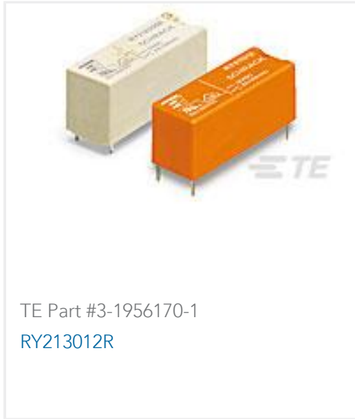
TE Part #3-1956170-1 RY213012R