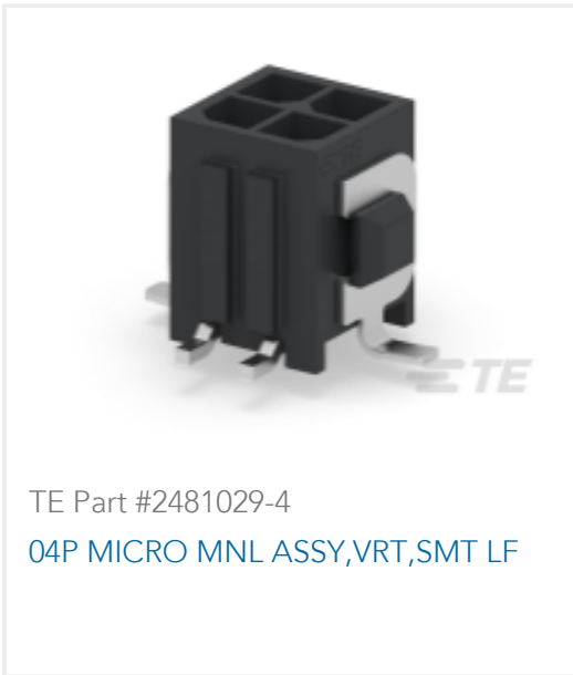
TE Part #2481029-4 04P MICRO MNL ASSY,VRT,SMT LF