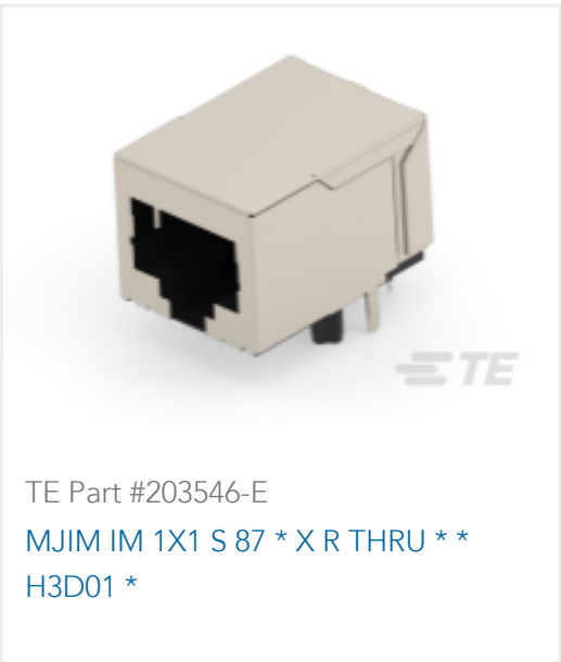
TE Part #203546-E MJIM IM 1X1 S 87 * X R THRU ** H3D01 *