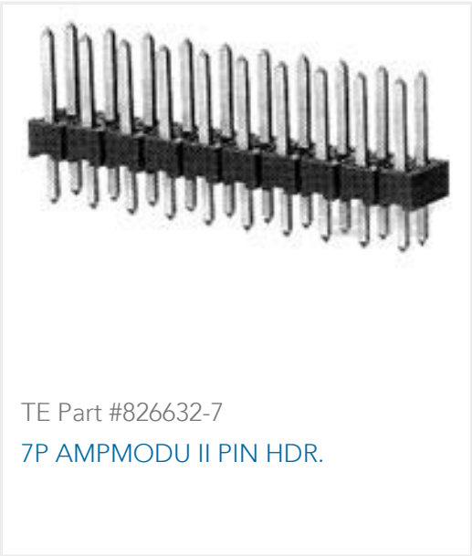
TE Part #826632-7 7P AMPMODU II PIN HDR.