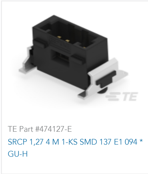
TE Part #474127-E SRCP 1,27 4 M 1-KS SMD 137 E1 094 * GU-H