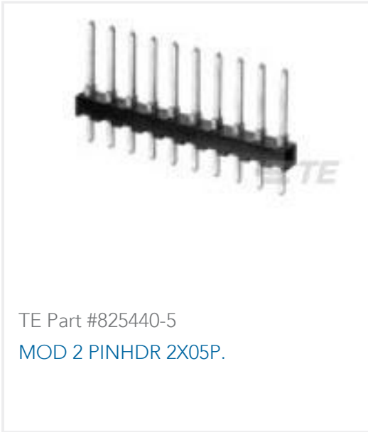
TE Part #825440-5 MOD 2 PINHDR 2X05P.