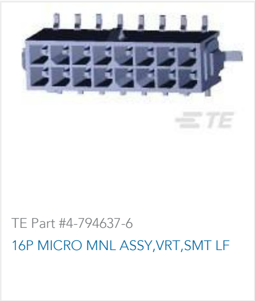
TE Part #4-794637-6 16P MICRO MNL ASSY,VRT,SMT LF