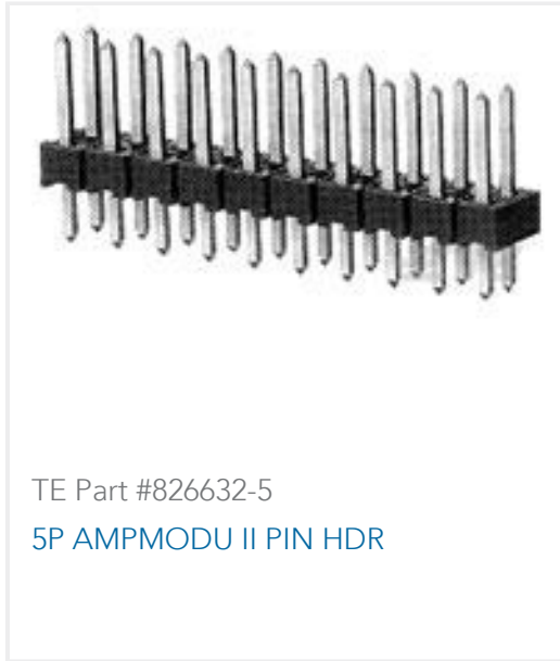
TE Part #826632-5 5P AMPMODU II PIN HDR