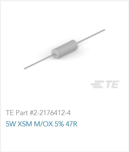
TE Part #2-2176412-4 5W XSM M/OX 5% 47R