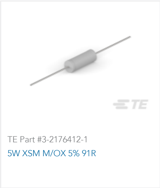
TE Part #3-2176412-1 5W XSM M/OX 5% 91R