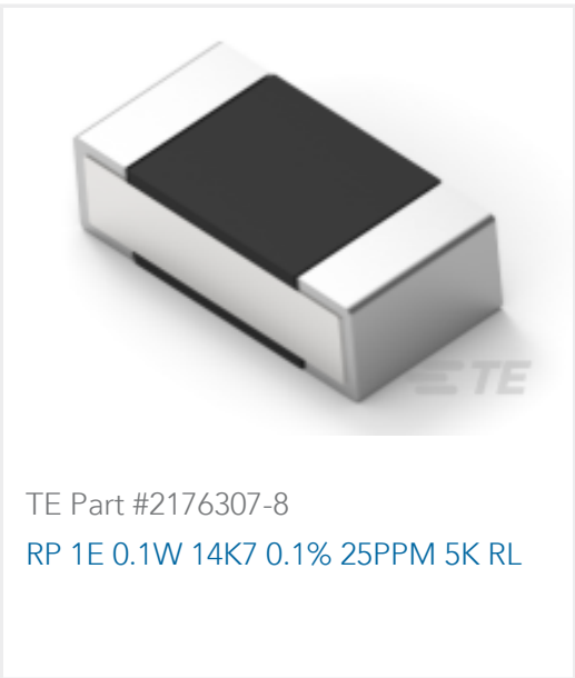
TE Part #2176307-8 RP 1E 0.1W 14K7 0.1% 25PPM 5K RL