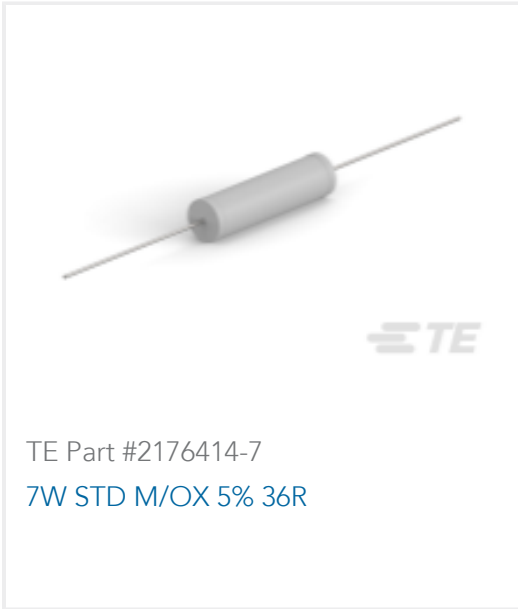
TE Part #2176414-7 7W STD M/OX 5% 36R