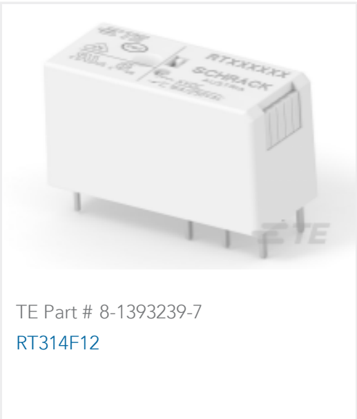
TE Part # 8-1393239-7 RT314F12