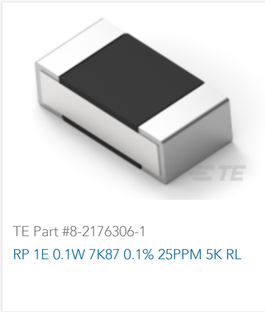
TE Part #8-2176306-1 RP 1E 0.1W 7K87 0.1% 25PPM 5K RL