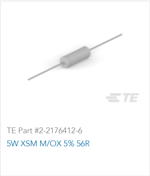
TE Part #2-2176412-6 5W XSM M/OX 5% 56R