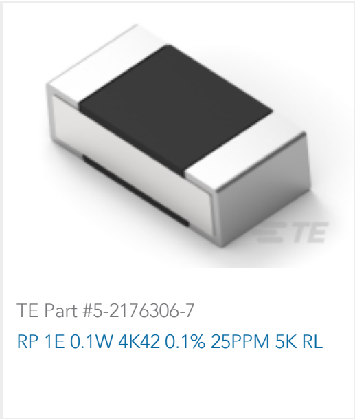
TE Part #5-2176306-7 RP 1E 0.1W 4K42 0.1% 25PPM 5K RL