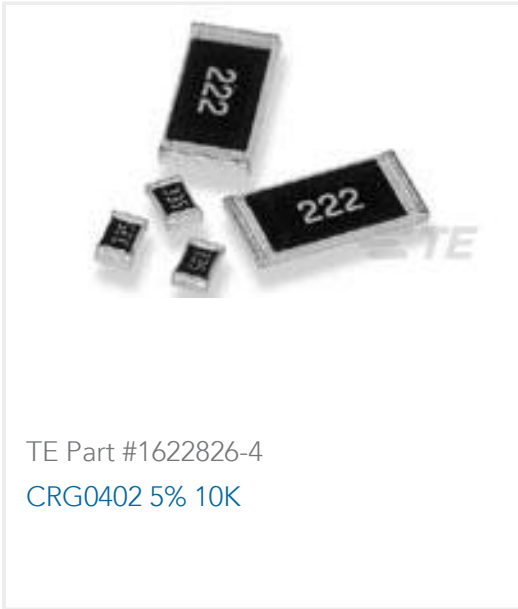
TE Part #1622826-4 CRG0402 5% 10K