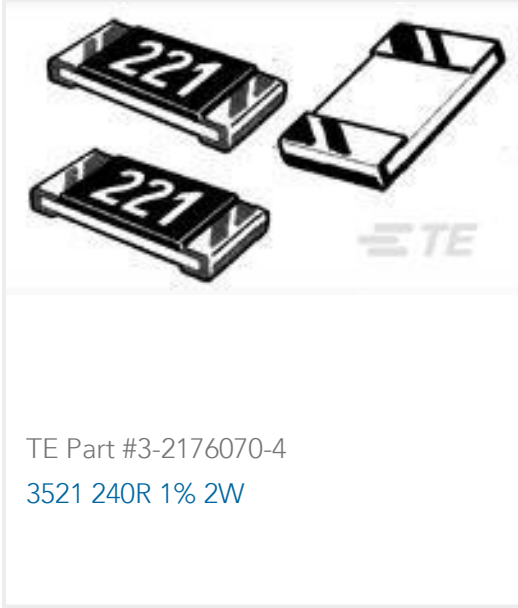
TE Part #3-2176070-4 3521 240R 1% 2W