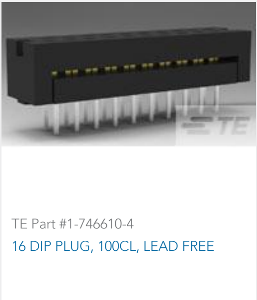
TE Part #1-746610-4 16 DIP PLUG, 100CL, LEAD FREE