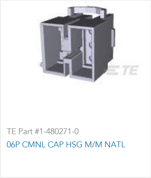
TE Part #1-480271-0 06P CMNL CAP HSG M/M NATL