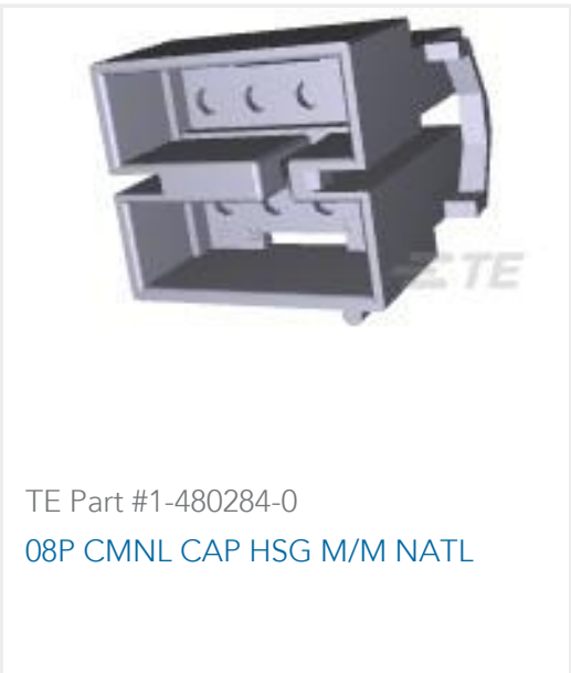
TE Part #1-480284-0 08P CMNL CAP HSG M/M NATL