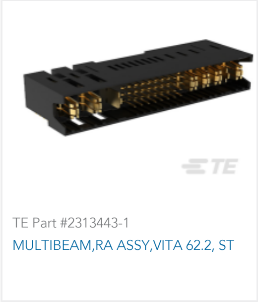
TE Part #2313443-1 MULTIBEAM,RA ASSY,VITA 62.2, ST