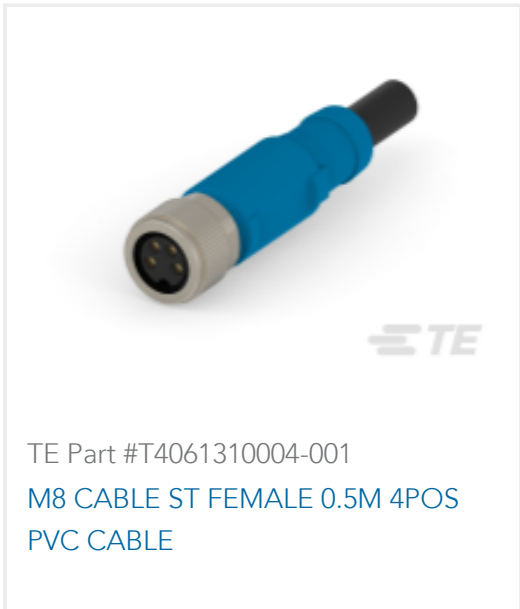
TE Part #T4061310004-001 M8 CABLE ST FEMALE 0.5M 4POS PVC CABLE