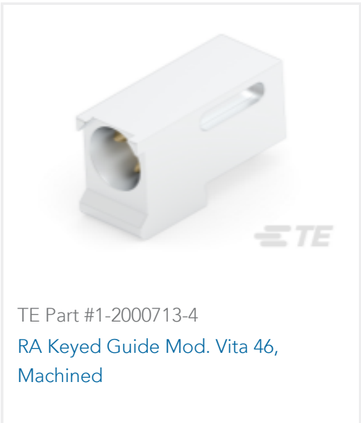
TE Part #1-2000713-4 RA Keyed Guide Mod. Vita 46, Machined