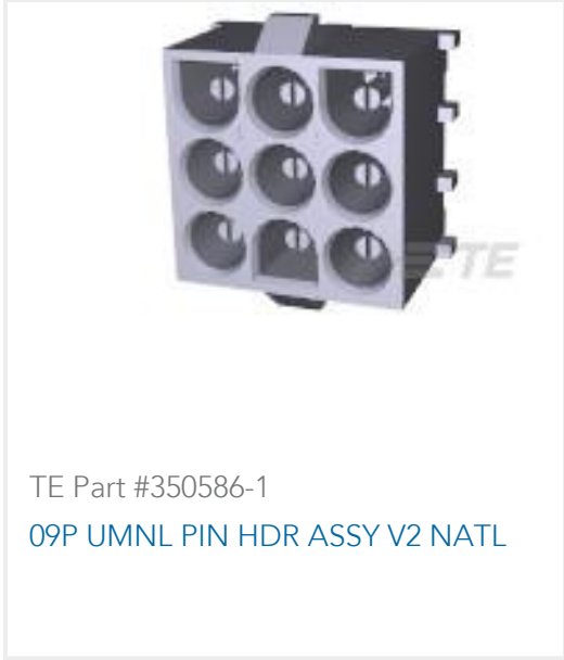
TE Part #350586-1 09P UMNL PIN HDR ASSY V2 NATL