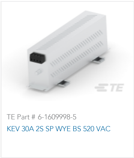
TE Part # 6-1609998-5 KEV 30A 2S SP WYE BS 520 VAC

This information is provided based on reasonable inquiry of our suppliers and represents our current actual knowledge based on the information they provided. This information is subject to change. The part numbers that TE has identified as EU RoHS compliant have a maximum concentration of 0.1% by weight in homogenous materials for lead, hexavalent chromium, mercury, PBB, PBDE, DBP, BBP, DEHP, DIBP, and 0.01% for cadmium, or qualify for an exemption to these limits as defined in the Annexes of Directive 2011/65/EU (RoHS2). Finished electrical and electronic equipment products will be CE marked as required by Directive 2011/65/EU. Components may not be CE marked. Additionally, the part numbers that TE has identified as EU ELV compliant have a maximum concentration of 0.1% by weight in homogenous materials for lead, hexavalent chromium, and mercury, and 0.01% for cadmium, or qualify for an exemption to these limits as defined in the Annexes of Directive 2000/53/EC (ELV). Regarding the REACH Regulation, the information TE provides on SVHC in articles for this part number is based on the latest European Chemicals Agency (ECHA) 'Guidance on requirements for substances in articles' posted at this URL: https://echa.europa.eu/guidance-documents/guidance-on-reach