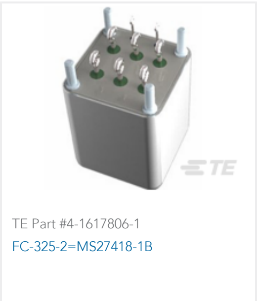
TE Part #4-1617806-1 FC-325-2=MS27418-1B