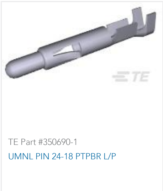
TE Part #350690-1 UMNLT PIN 24-18 PTPBR L/P