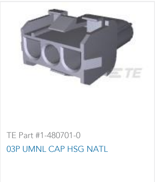
TE Part #1-480701-0 03P UMNLT CAP HSG NATL