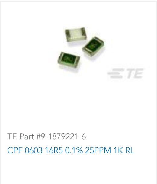
TE Part #9-1879221-6 CPF 0603 16R5 0.1% 25PPM 1K RL