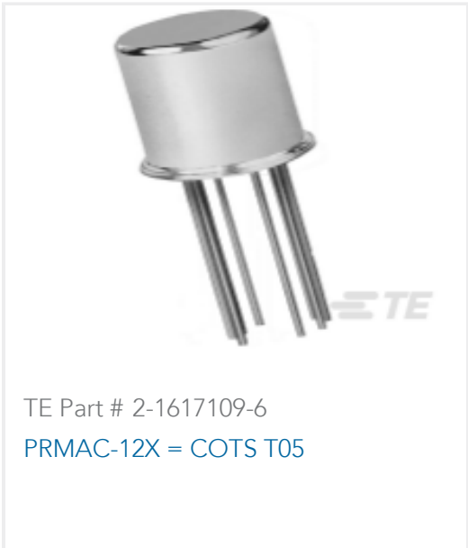
TE Part # 2-1617109-6 PRMAC-12X = COTS T05