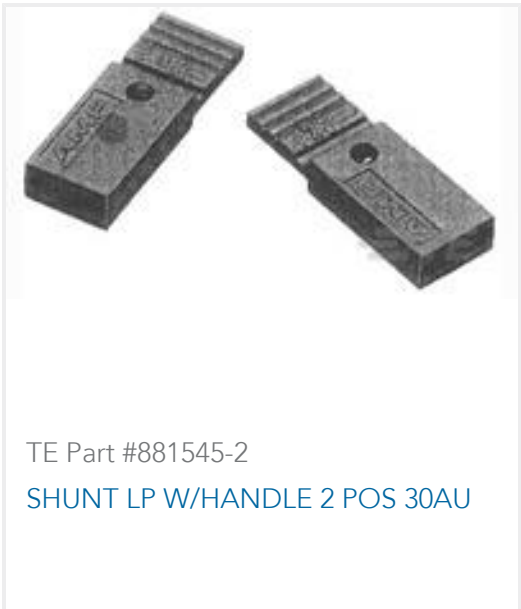
TE Part #881545-2 SHUNT LP W/HANDLE 2 POS 30AU