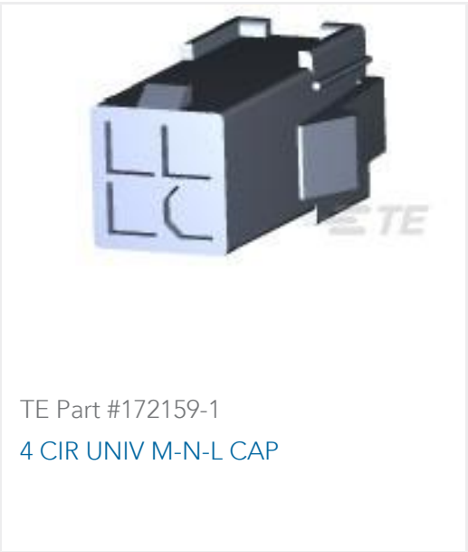
TE Part #172159-1 4 CIR UNIV M-N-L CAP