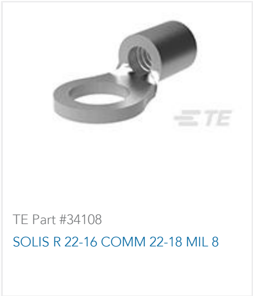
TE Part #34108 SOLIS R 22-16 COMM 22-18 MIL 8