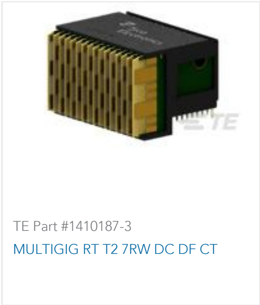
TE Part #1410187-3 MULTIGIG RT T2 7RW DC DF CT