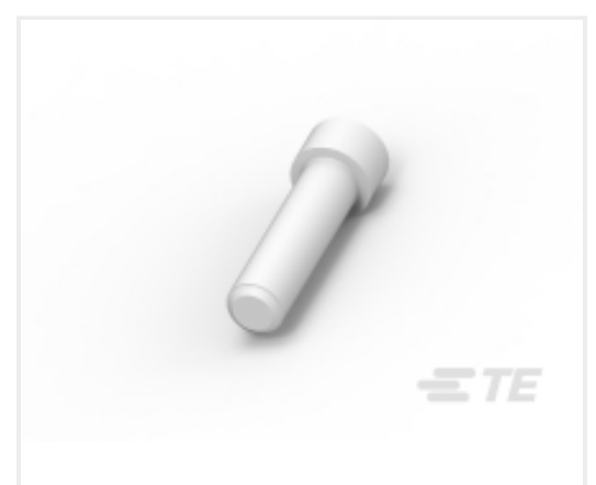
TE Part #114017-ZZ SEALING PLUG, SIZE 12/16, WHT