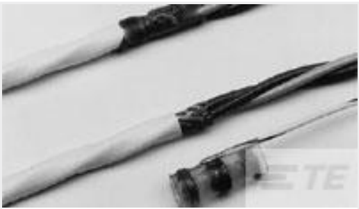
TE Part #621055-000 D-142-51