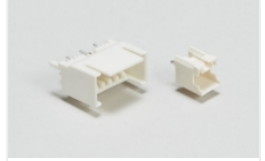
Wire-to-Board Headers & Receptacles