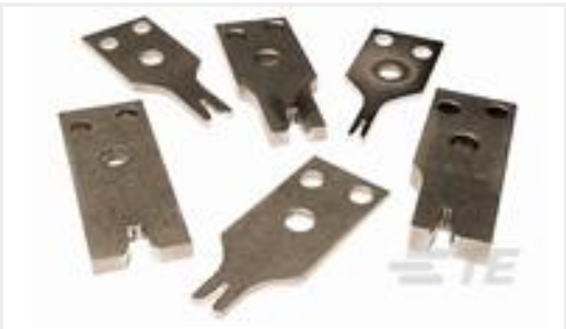
TE Part #1-937188-0 WIRE CRIMPER