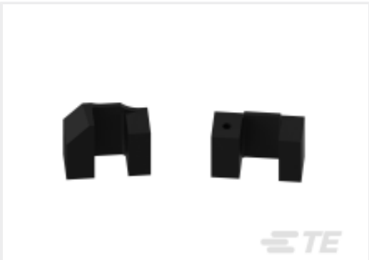
TE Part #937196-1 HOLDER,SHEAR FRONT