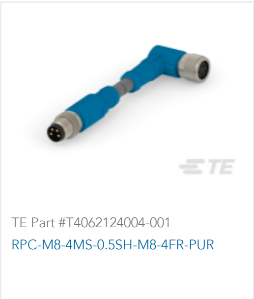
TE Part #T4062124004-001 RPC-M8-4MS-0.5SH-M8-4FR-PUR