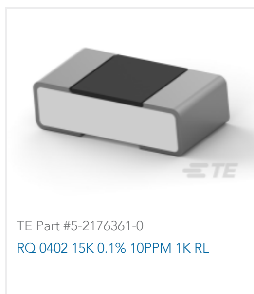
TE Part #5-2176361-0 RQ 0402 15K 0.1% 10PPM 1K RL