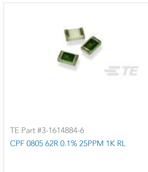
TE Part #3-1614884-6 CPF 0805 62R 0.1% 25PPM 1K RL