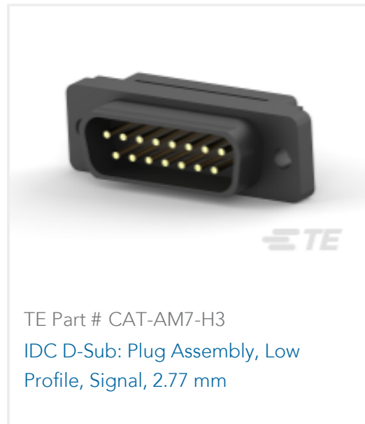
TE Part # CAT-AM7-H3 IDC D-Sub: Plug Assembly, Low Profile, Signal, 2.77 mm