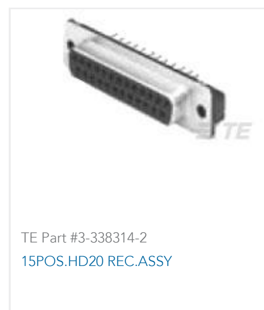
TE Part #3-338314-2 15POS.HD20 REC.ASSY