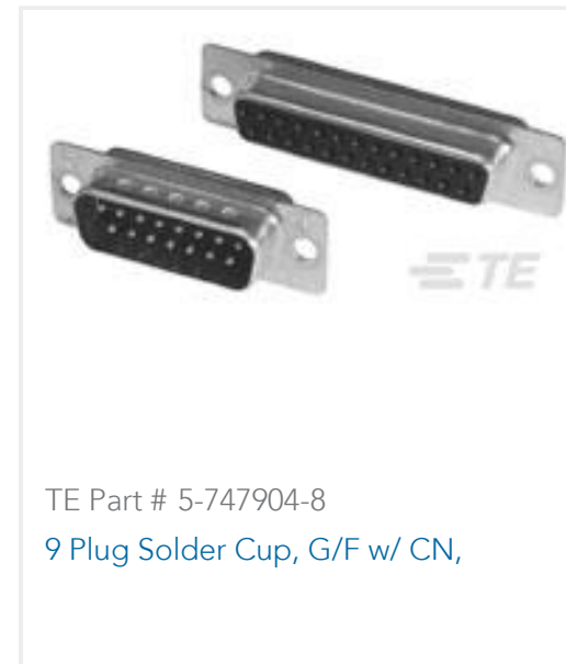
TE Part # 5-747904-8 9 Plug Solder Cup, G/F w/ CN,