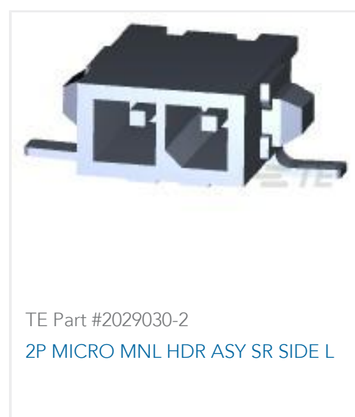
TE Part #2029030-2 2P MICRO MNL HDR ASY SR SIDE L