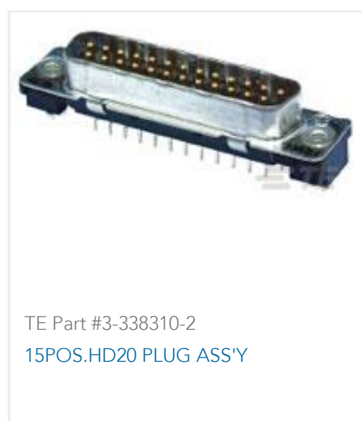
TE Part #3-338310-2 15POS.HD20 PLUG ASS'Y