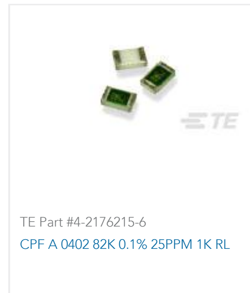
TE Part #4-2176215-6 CPF A 0402 82K 0.1% 25PPM 1K RL