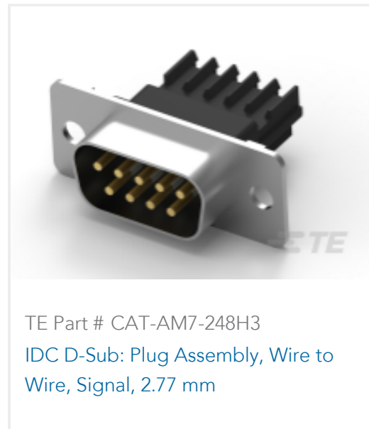
TE Part # CAT-AM7-248H3 IDC D-Sub: Plug Assembly, Wire to Wire, Signal, 2.77 mm