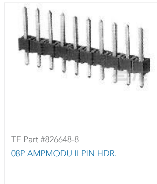
TE Part #826648-8 08P AMPMODU II PIN HDR.