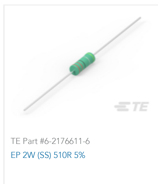
TE Part #6-2176611-6 EP 2W (SS) 510R 5%