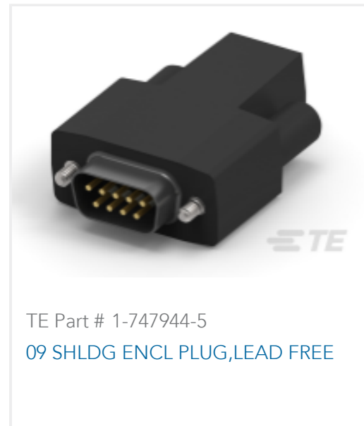
TE Part # 1-747944-5 09 SHLDG ENCL PLUG, LEAD FREE