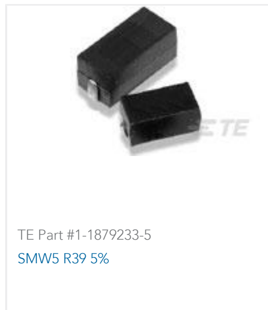
TE Part #1-1879233-5 SMW5 R39 5%