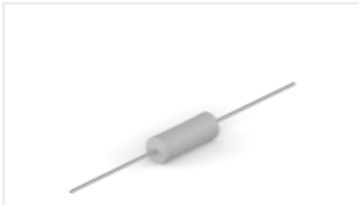
TE Part #5-2176412-5 5W XSM M/OX 5% 910R