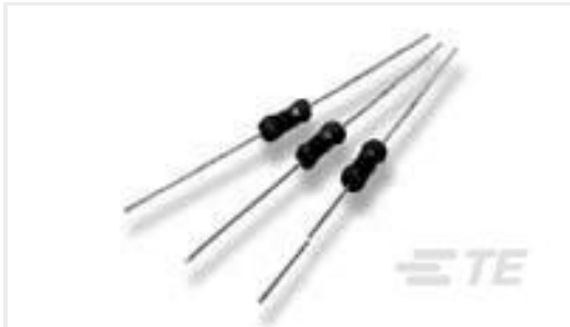
TE Part #1-1625893-5 5W SM M/OX 5% 18R