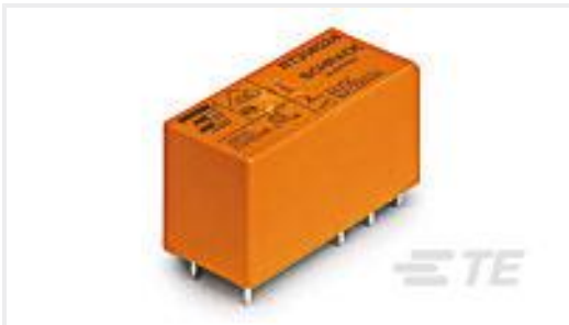
TE Part #7-1393238-2 RTD14110