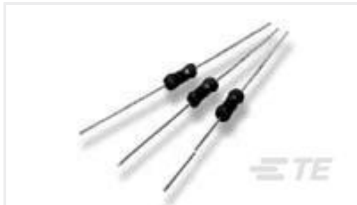
TE Part #1625893-4 5W SM M/OX 5% 22R