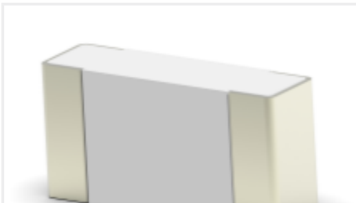
TE Part #8-2176243-5 CRGS0603 5% 10M