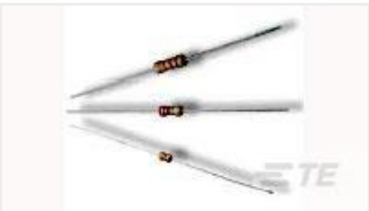
TE Part #2-1623925-4 CFR100 5% 22R