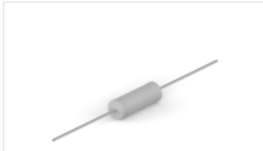
TE Part #3-2176412-7 5W XSM M/OX 5% 160R