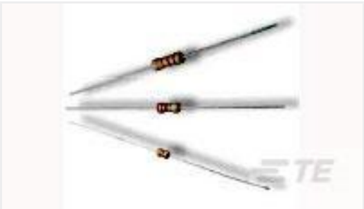
TE Part #1623929-6 CFR200 5% 120R