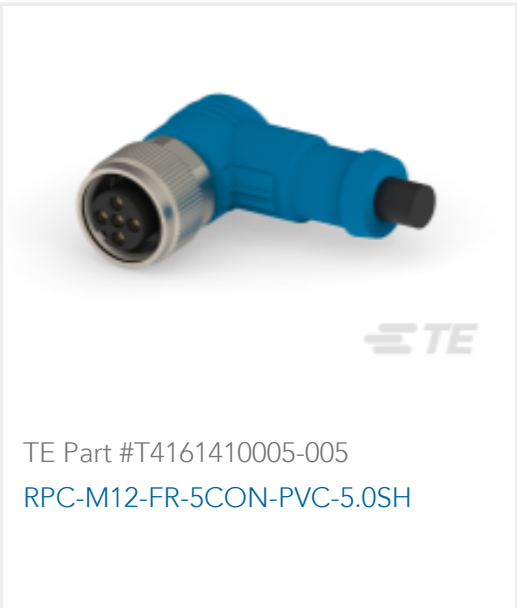
TE Part #T4161410005-005 RPC-M12-FR-5CON-PVC-5.0SH