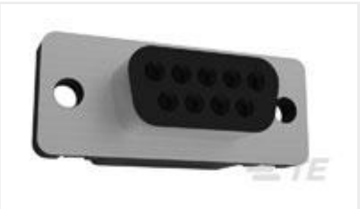
TE Part #1658610-4 09 POS HDF RCPT, MS, LEAD FREE