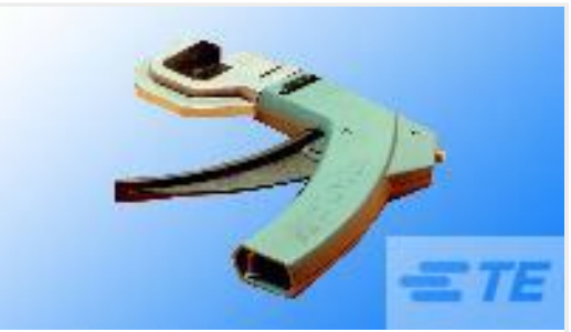
TE Part #58247-1 MTA 156 CRIMP HEAD REPAIR DISCRETE