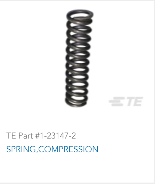
TE Part #1-23147-2 SPRING, COMPRESSION