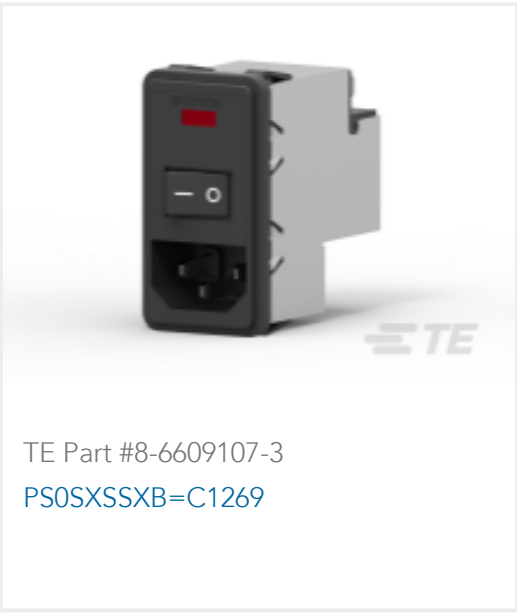
TE Part #8-6609107-3 PS0SXSSXB=C1269