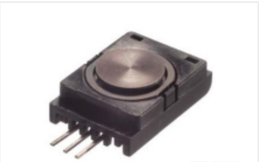
TE Part #FS2050-0000-1500-G FS2050 COMPRESSION LC1500 GRAM