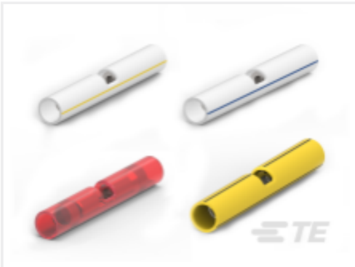
TE Part #CAT-P592-B98 PIDG Butt Splices