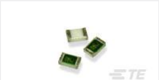
TE Part #1614929-2 CPF0805 3K3 0.1% 25PPM 5K RL