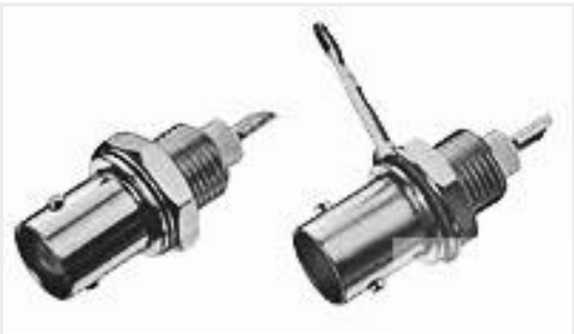
TE Part #5227169-8 BNC - SOLDER RECEPT