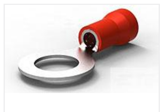
TE Part #52262-1 TERMINAL R PG 8 1/2