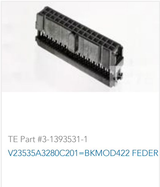
TE Part #3-1393531-1 V23535A3280C201=BKMOD422 FEDER