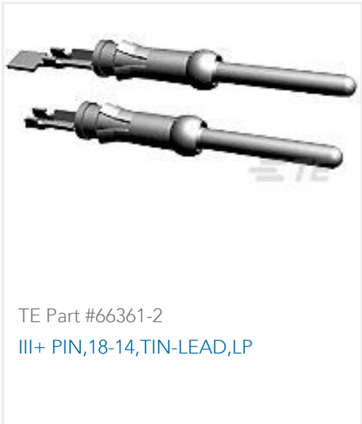
TE Part #66361-2 III+ PIN,18-14,TIN-LEAD,LP