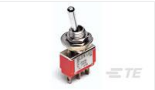
TE Part #3-1825139-9 A211SYZQ04