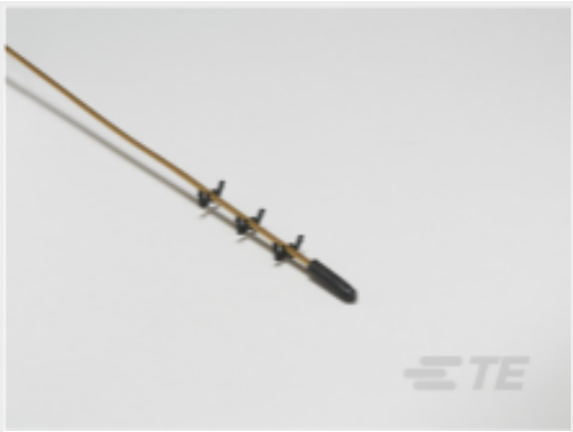
TE Part #CAT-TRA0001 Piezoelectric Traffic Sensor