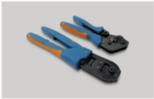
Hand Crimping Tools(2)