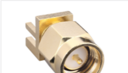
TE Part #L9000276-01 SMA Plug 50 Ohm .062 PCB Edge Mount