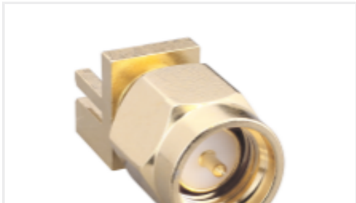
TE Part #L9000274-01 SMA Plug 50 Ohm .031 PCB Edge Mount