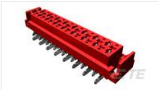
TE Part #2-338069-0 MICRO-MATCH SMD FTE