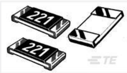
TE Part #1-1622820-7 3520 1M 5%