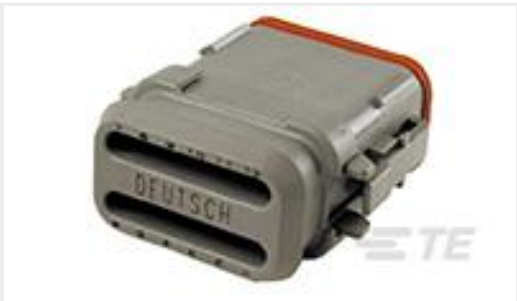
TE Part #DT06-12SA-CE04 PLG, 12P, GRY, E, XCAP, A