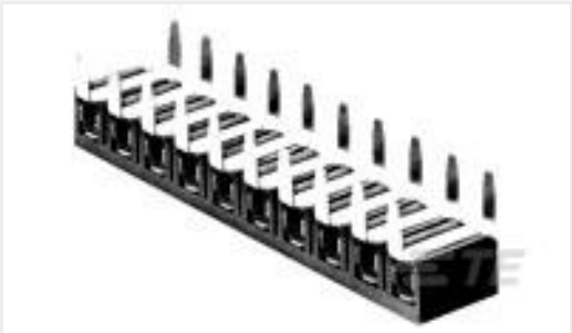
TE Part #87988-4 04 MODI BDMNT RCPT SR .156CL