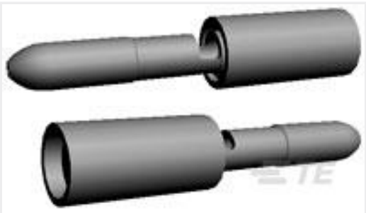
TE Part #141462-1 TERMINAL PIN PIDG 12 16