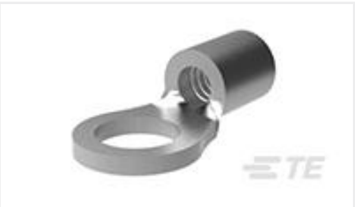
TE Part #34119 TERMINAL,SOLIS R 16-14 4