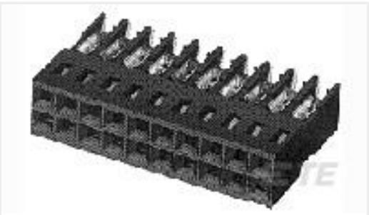
TE Part #5-102398-8 20 AMPMODU MT ASSY DR .100CL