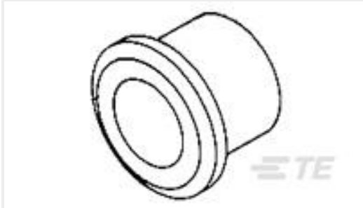
TE Part #2-350377-0 MR SPLT GROMET .156 DIA BLK LF