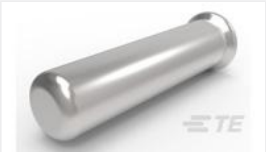
TE Part #380598-1 RCR AU-SPR AU-CUP 018-040