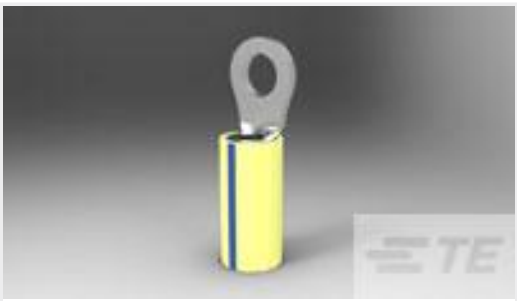
TE Part #53057 TERMINAL, PIDG, R, IR, 24, #10