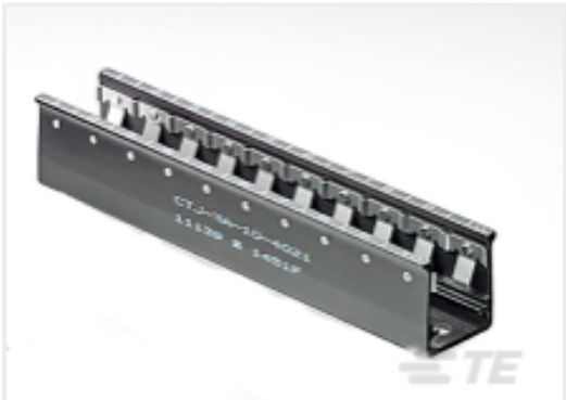
TE Part #CTJ-3D-05 RAIL ASSY