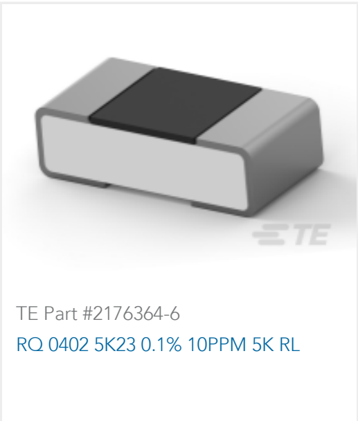
TE Part #2176364-6 RQ 0402 5K23 0.1% 10PPM 5K RL