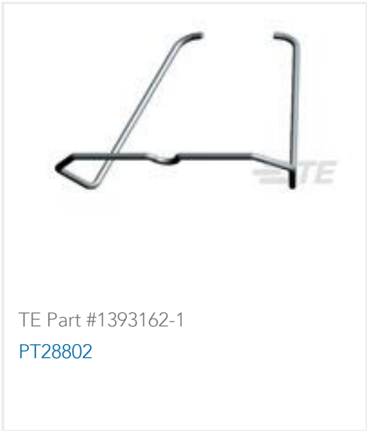
TE Part #1393162-1 PT28802