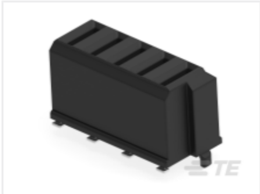
TE Part #214547-E MSPPM 5 F SMD F6 * A V 137 094 * E008 J