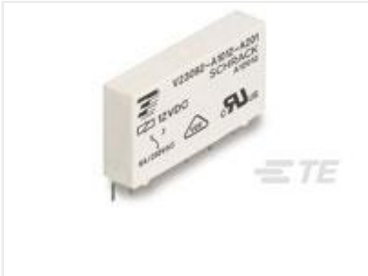
TE Part #2-1393236-4 V23092-A1024-A301