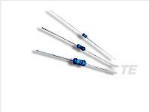
TE Part #1622544-1 LR1 1% 680K