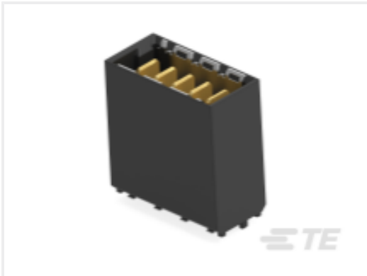
TE Part #214552-E MSPPM 5 M SMD M10 * A V 137 094 * E008 J