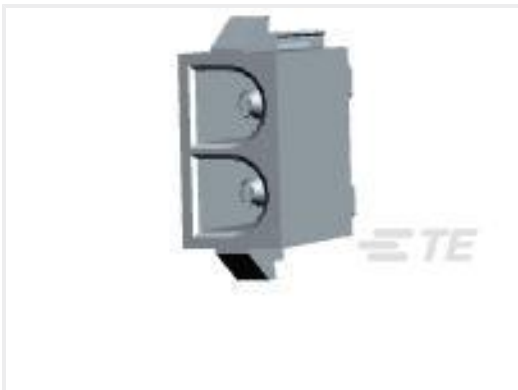
TE Part #641964-3 02P UMNL PIN HDR ASSY POL LF