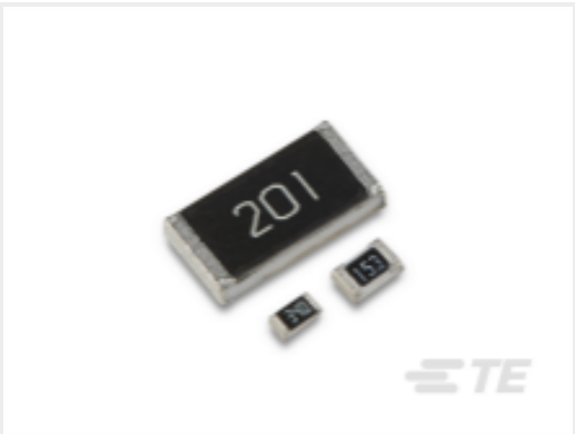
TE Part #2-2176328-9 CRGP 1206 2K2 1%