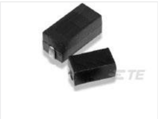
TE Part #6-1879022-3 SMF3 120K 5%