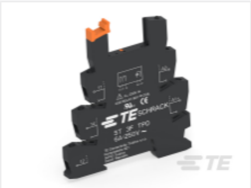
TE Part #2-1416100-2 ST3FTP0