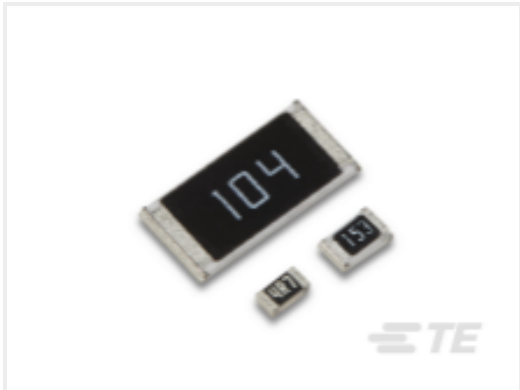
TE Part #4-2176349-6 CRGCQ 2512 56K 1%