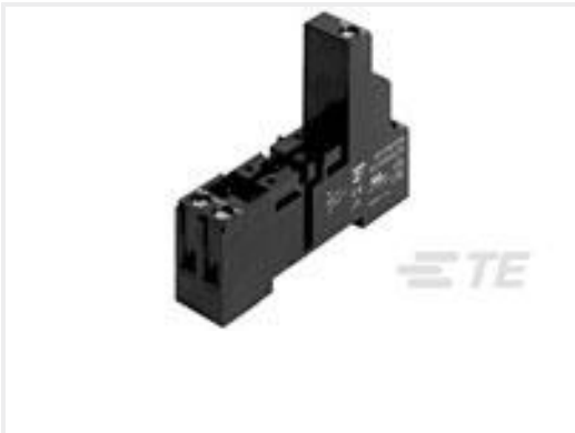
TE Part #6-1415035-1 RT78726