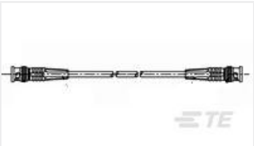
TE Part #1337769-5 50 OHM COAX BNC STR PLUG P99-E