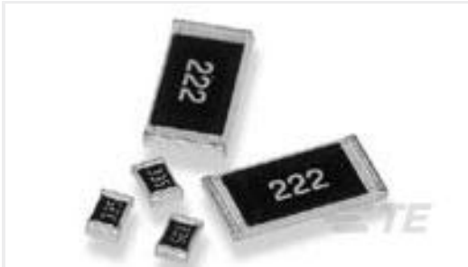
TE Part #1623274-1 CRG0805 1% 68R