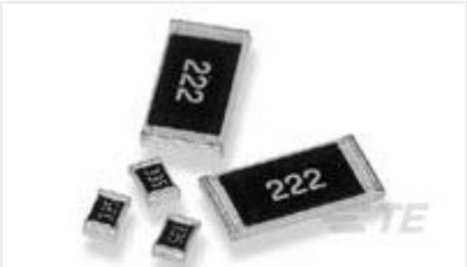
TE Part #1623107-1 CRG0805 1% 120R