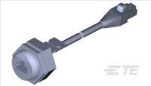
TE Part #1546414-4 ETHRNT RJ-45 BLKHD PASSTHRU12"