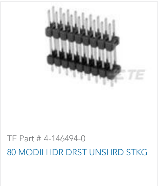
TE Part # 4-146494-0 80 MODII HDR DRST UNSHRD STKG