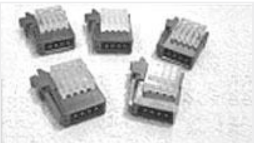
TE Part #1-1473562-4 RITS CONN. PLUG ASSY 4P RED