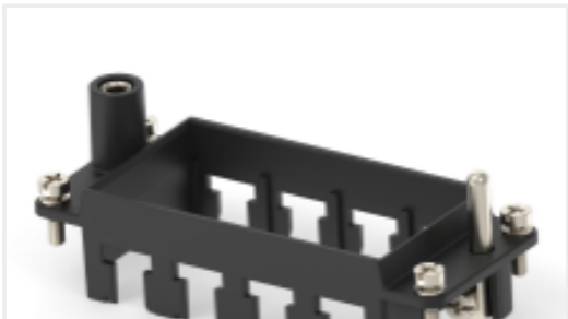
TE Part #T2070164101-002 H16BN-T4-M-HD