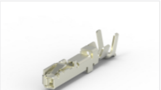
TE Part #2316671-4 HD1 REC CONTACT AU0.38 2L SIZE LP