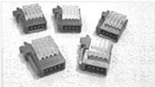
TE Part #4-1473562-3 RITS CONN. PLUG ASSY 3P GREEN