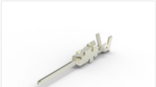
TE Part #2316669-2 HD1 TAB CONTACT AU0.38 M SIZE L /P