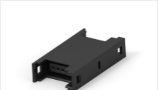
TE Part # 5-1473571-4 RITS.JUNCTION BOX 2D 4P F/H