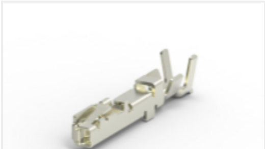
TE Part #2316671-2 HD1 REC CONTACT AU0.38 M SIZE L /P