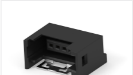
TE Part # 1-1565994-4 RITS HDR ASSY R/A SMT TYPE 4P