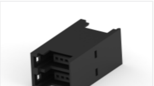
TE Part # 5-1473574-4 RITS.JUNCTION BOX 4D 4P F/H