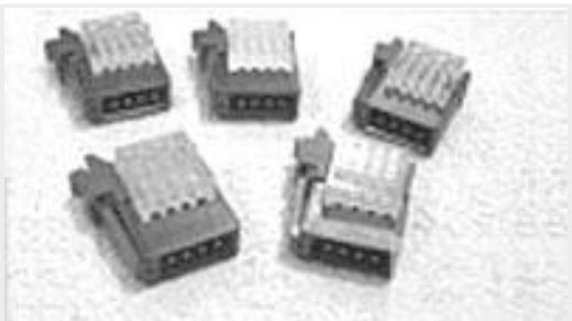
TE Part #3-1473562-4 RITS CONN. PLUG ASSY 4P ORANGE