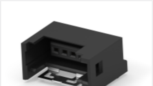
TE Part # 1565994-4 RITS HDR ASSY R/A SMT TYPE 4P WITH BOSS