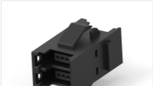
TE Part # 1473574-4 RITS.JUNCTION BOX 4D 4P P/M