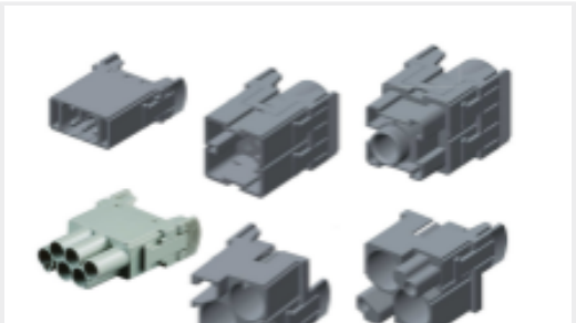
TE Part #CAT-H3399-H648 HDC HMN Modular System, Rail Compliant