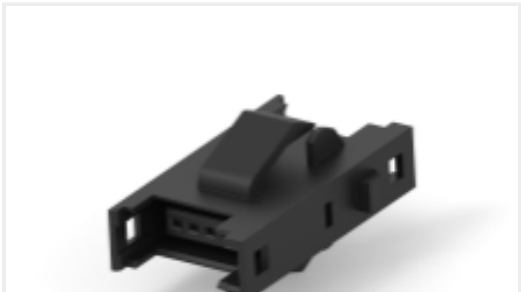
TE Part # 1473571-4 RITS.JUNCTION BOX 2D 4P P/M