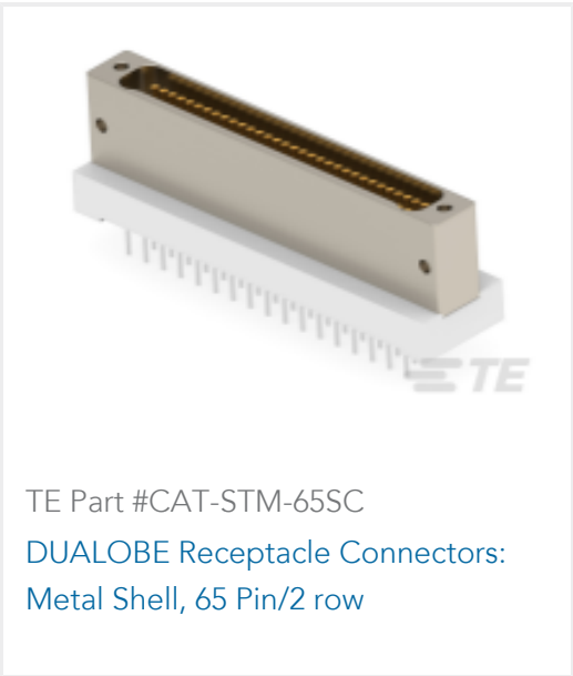
TE Part #CAT-STM-65SC DUALOBE Receptacle Connectors: Metal Shell, 65 Pin/2 row