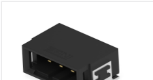
TE Part #284052-E SRCA 2,54 3 M 1 SMD 137 E1 094 * GURT *