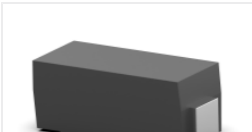
TE Part #4-2176459-2 SMW 7W 5R1 5% Taped