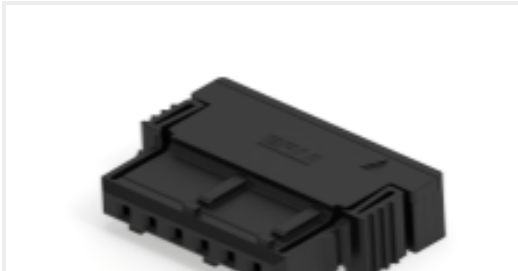
TE Part #364240-E SRCBUG A 2,54 2 6 CSI 112 E1 ADV J 2 324