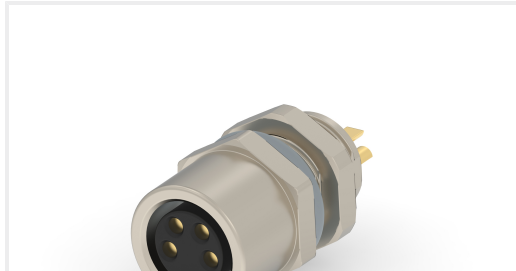
TE Part #T4033014041-000 M8.FMLE.PNLFRONT.4POS.STR