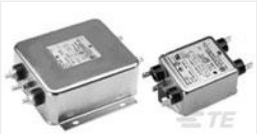
TE Part #6609042-4 20VS1=F7249 S0