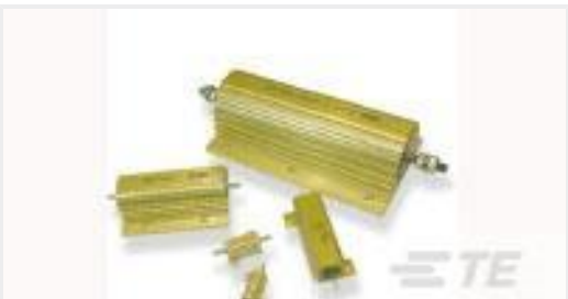
TE Part #1-1625999-8 HSC100 220R 5%