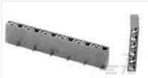
TE Part #1241152-4 4P HV100 REC. CON, SMD, GOLD, BLISTER