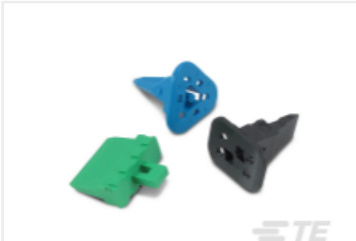
TE Part #CAT-D487-W416 Wedgelocks: DEUTSCH DT