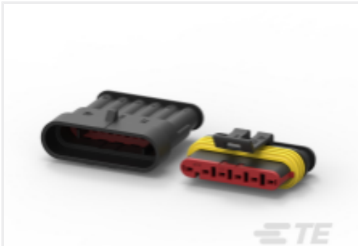
TE Part #CAT-AM71-CH8172 AMP SUPERSEAL 1.5MM, CONNECTOR HOUSING