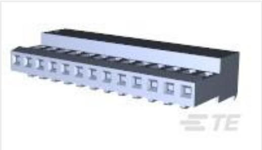
TE Part #4-640440-3 13P MTA100 CONN ASSY 22AWG RED