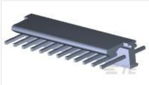
TE Part #1-640456-2 12P MTA100 HDR ASSY F/L SQ STR