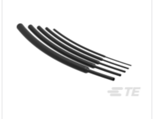
TE Part #CAT-HST-RNF100-0 RNF-100-0 Heat Shrink Tubing