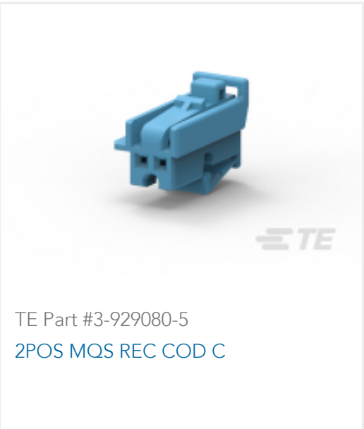
TE Part #3-929080-5 2POS MQS REC COD C