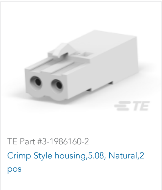
TE Part #3-1986160-2 Crimp Style housing, 5.08, Natural, 2 pos