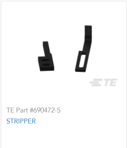
TE Part #690472-5 STRIPPER