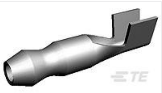
TE Part #63989-1 180 SHUR PLUG 14-10 018TPBR