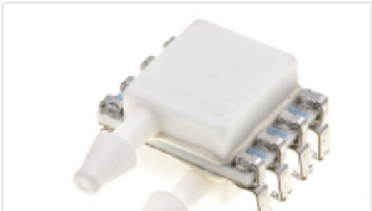
TE Part #4525-DS3A001DP 1PSI DP PRESSURE SENSOR 10% TO 90%