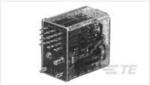
TE Part #8-1393765-6 R10-E1W2-S50=R10