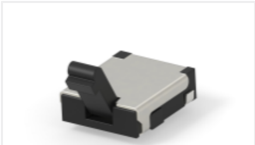
TE Part #2331413-1 DET SW4.2X3.6X1.2 JB VERT(DW) NO AGAU RL