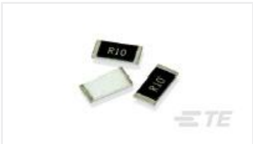
TE Part #3-2176050-1 RLP73K 1E R91 5% 5K RL