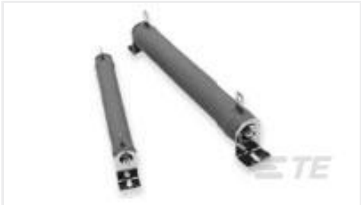
TE Part #3-1879457-9 TE 2500W 1K5 5% Bracket