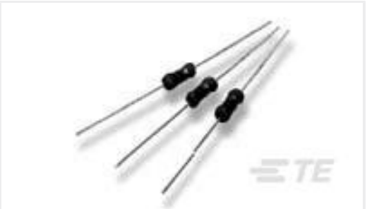
TE Part #5-1879353-3 RR02 5% 620K AMMO