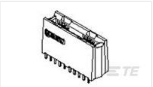
TE Part #6651331-1 287-0032-11301=CONN,SKT, CRNEDGE